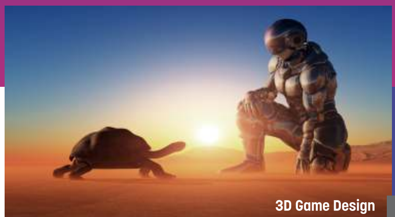
3D Game Design